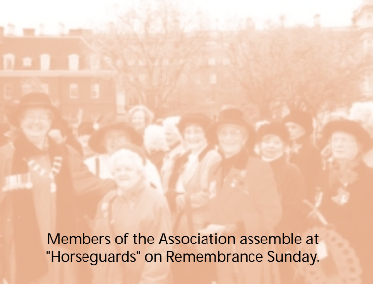
Members of the Association assemble at "Horseguards" on Remembrance Sunday.